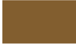
Brown PANTONE 18-0937 Bronze Brown