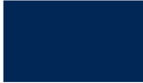
Blue PANTONE PQ-295C Navy Blue