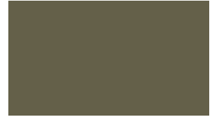
Green PANTONE PQ-18-0521B Brunt Olive