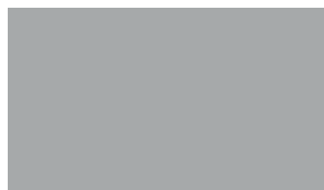
Gray PANTONE Silver C