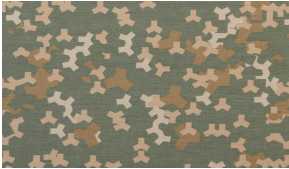
TripleX camouflage unique pattern (terrains, forest, urban, transitional terrain.)

ATTENTION: Pantone reference numbers are for reference ONLY. On digital screen color can be different from reality.